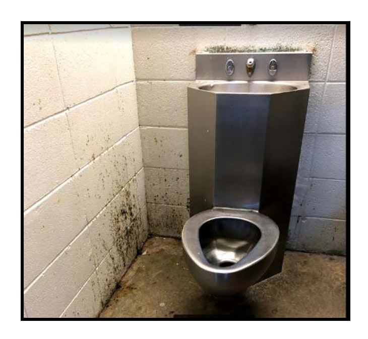
Figure 2: Photo of Mold in Camp J Shortly After Camp Closure.