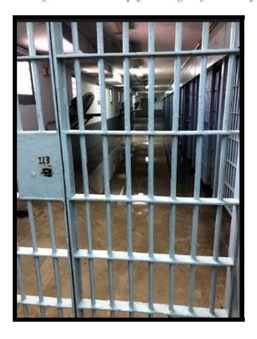
Figure 3 Row Of Cells With Flooding Shortly After Camp J's Closure.

160. The locks for the cells in Camp J malfunctioned, sometimes opening on their own.<sup>175</sup> A complicated procedure for locking the doors was required to prevent the doors from opening on their own and, even if the procedure was followed, there was no guarantee the doors would stay locked, leading to incredibly dangerous confinement conditions.